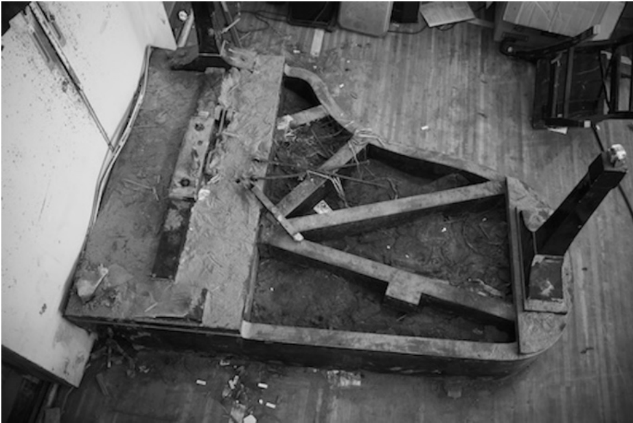
A grand piano destroyed by tsunami in the Minato district of Ishinomaki, Miyagi prefecture. Photographed in 2011.