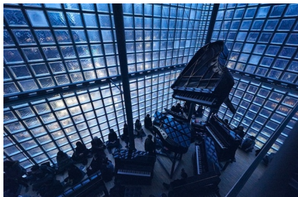
Tomoko Mukaiyama pianist 2019 / Maison Hermès