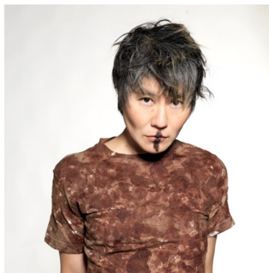
Tomoko Mukaiyama Wasted 2009 / Echigo-Tsumari Art Triennale 2009